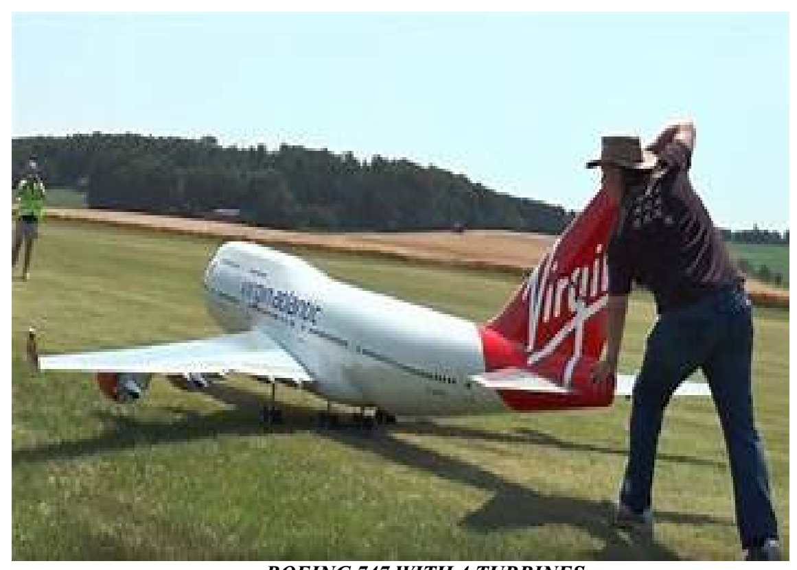
BOEING 747 WITH 4 TURBINES