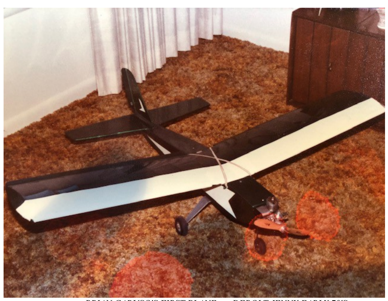
BRIAN CARUSO'S FIRST PLANE-----DEBOLT JENNY EARLY 70'S