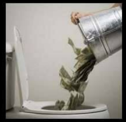
What the hobbyshop thinks I do