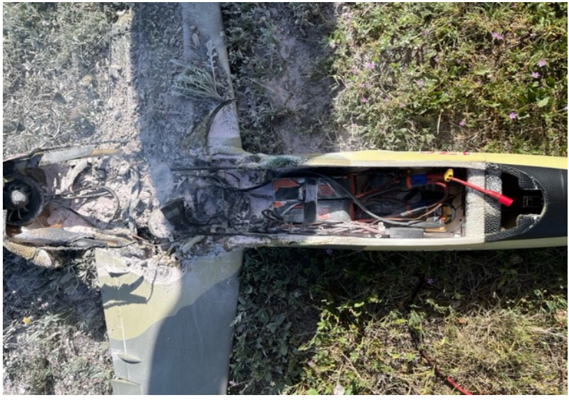
P.S. THE PLANE FLYS BEAUTIFULLY AND IS REALLY A "HOT" PERFORMER (PUN INTENDED!!)

THIS HAPPENED ABOUT 90 SECONDS INTO MAIDEN ZACH WAS ABLE TO GET INTO THE LANDING PATTERN BEFORE THE RADIO QUIT PLANE WAS BURNING IN THE AIR, MOST LIKELY A BAD SPEED CONTROL. FORTUNATLY NO FIRE OTHER THAN THE PLANE! BANANA HOBBIES REPLACED THE PLANE AND BATTERIES UNDER WARRANTY AND BRIAN HAS A NEW L-39 ALMOST READY TO COME OUT. THIS UNDER LINES THE IMPORTANCE OF HAVING FIRE FIGHTING EQUIPMENT AT HAND WHEN FLYING-