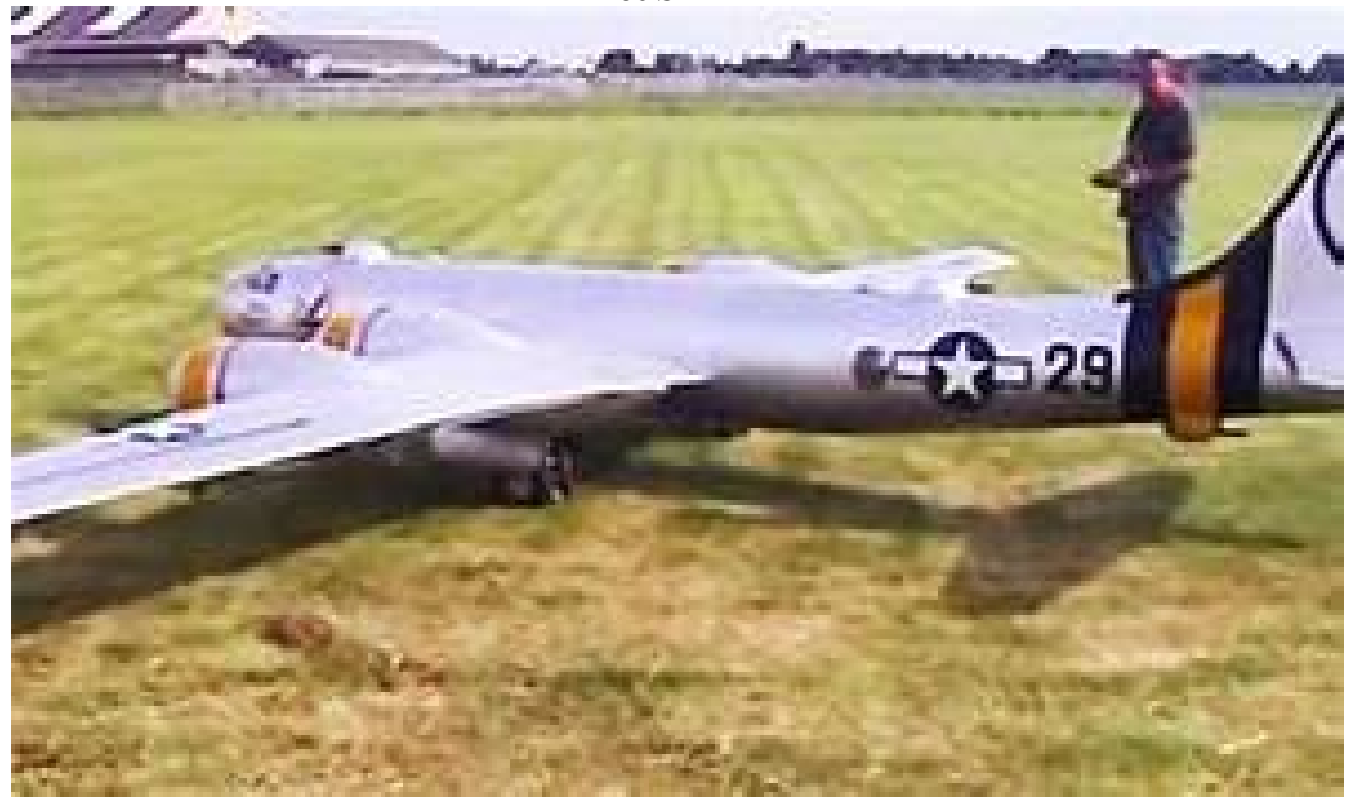
BOEING B-29 THE MODELS WITH PISTON ENGINES NORMALY HAVE ULTR-LIGHT GAS MOTORS