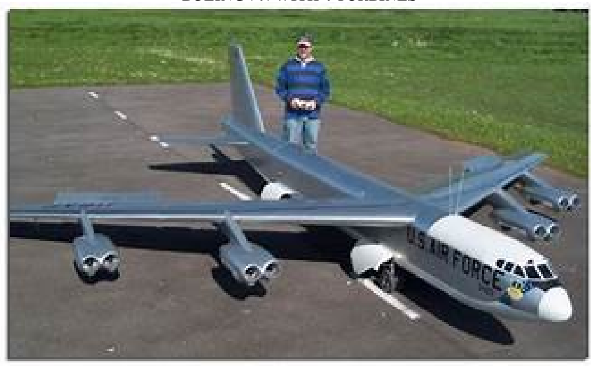
BOEING B-52 WITH 8 TURBINES!