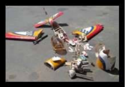
what I really do