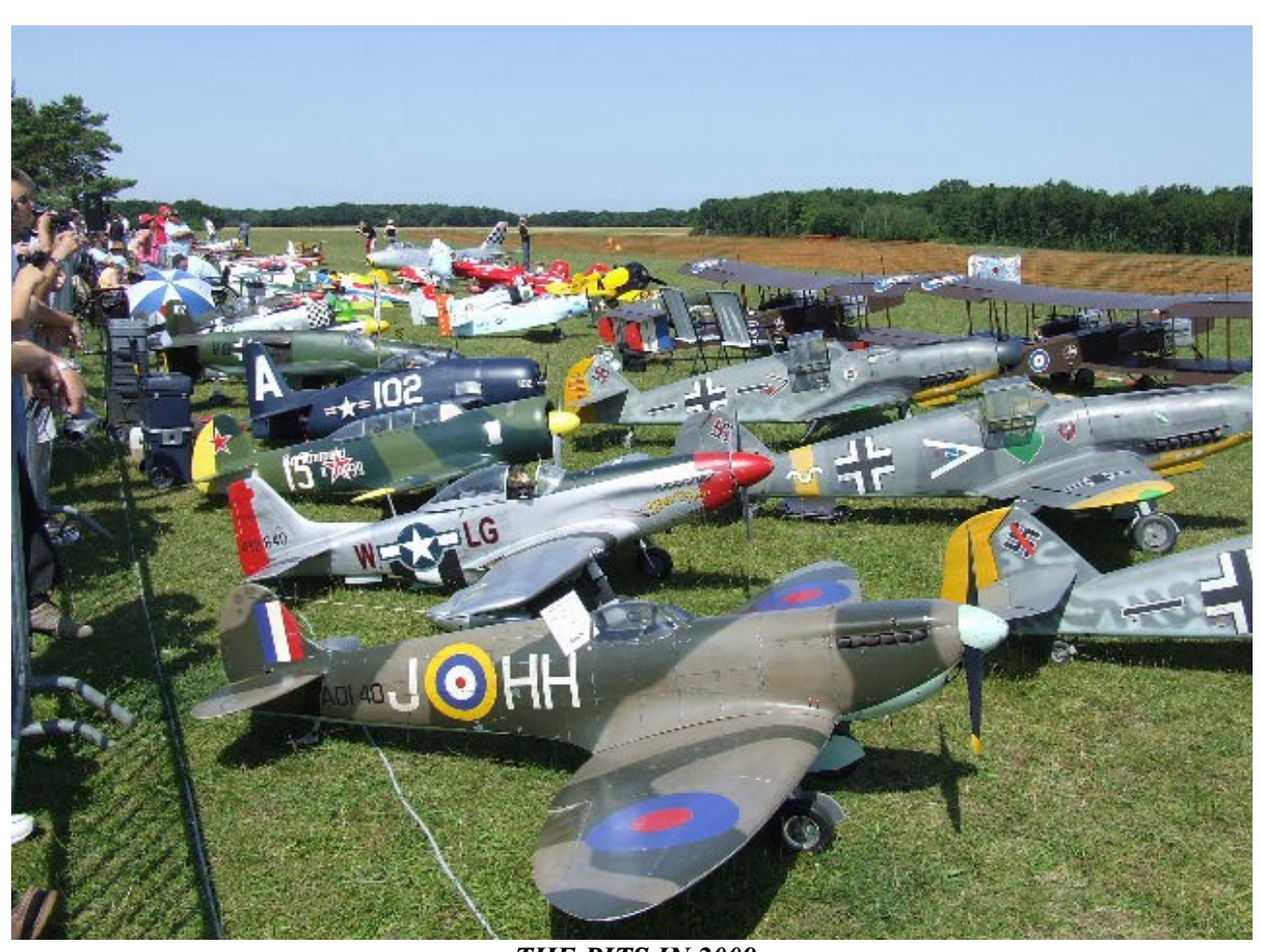
THE PITS IN 2009