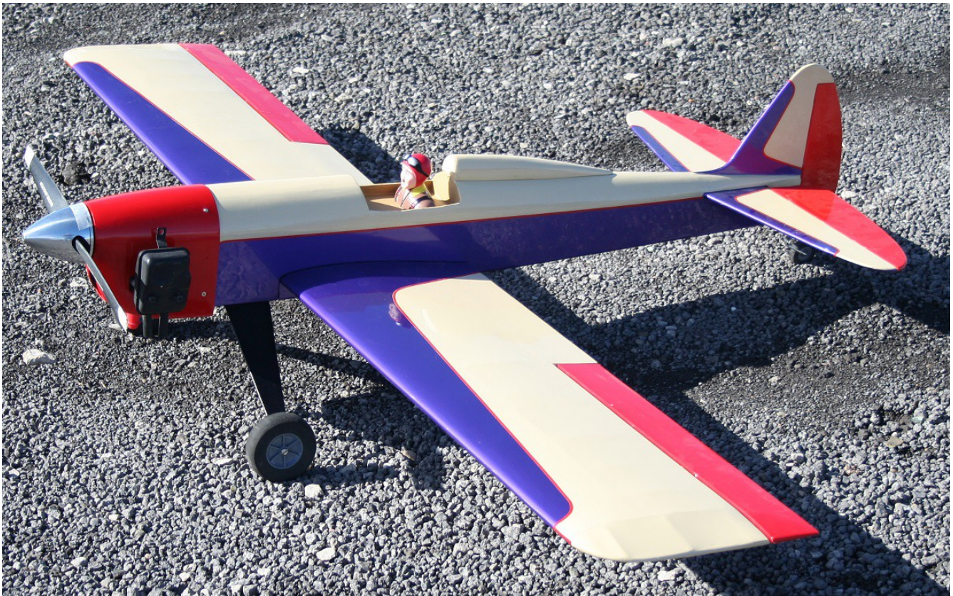
JOHN'S LATEST CREATION-ZENOAH G-26 POWERED

PLEASE KEEP THIS INFORMATION FOR FUTURE REFERENCE