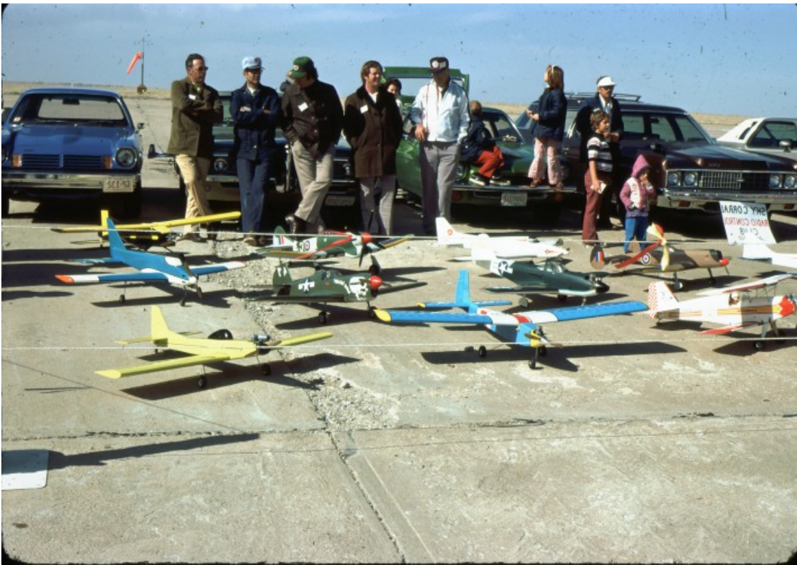
SKY CORRAL DISPLAY AT LA JUNTA BOYS RANCH FLY-IN IN 1975

I AM ALWAYS LOOKING FOR ARTICLES FOR THE NEWSLETTER SO IF YOU SEE SOMETHING YOU THINK THE MEMBERS MIGHT FIND INTERESTING SEND IT TO ME AND I WILL PUT IT IN THE NEXT NEWSLETTER.