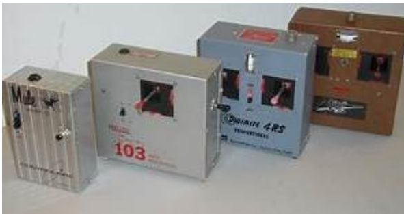
SINGLE CHANNEL, GALLOPING GHOST, BONNER 4 CHANNEL, PCM 4CHANNEL