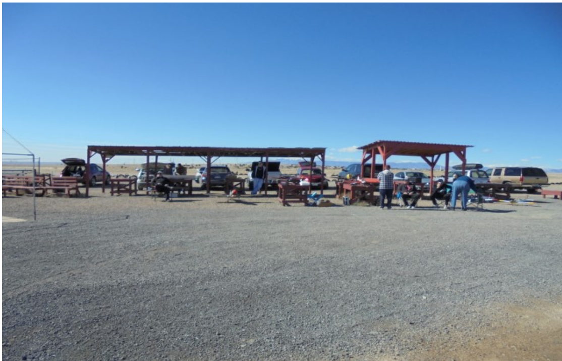
SUNDAY FLYING --APRIL 24TH 2019