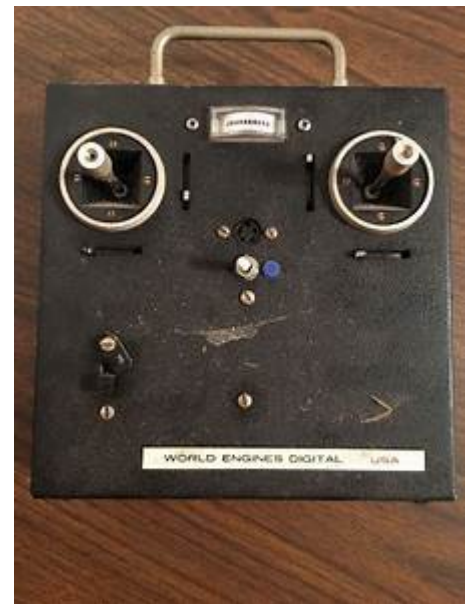
WORLD ENGINES BLUE MAX KIT RADIO

THE PRICE FOR MOST OF THESE SETS WAS OVER $300 IN 1970