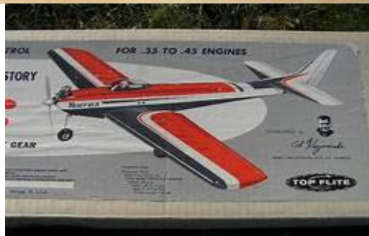
GRAND DADDY OF ALL PATTERN PLANES- TAURUS