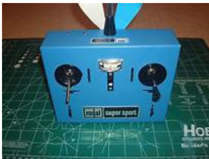
MOST POPULAR-ROYAL SPORTSMAN 6 CHANNEL