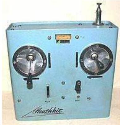
HEATHKIT KIT RADIO 5 CHANNELS