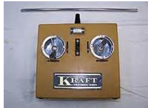
KRAFT GOLD MEDAL FOUR CHANNEL