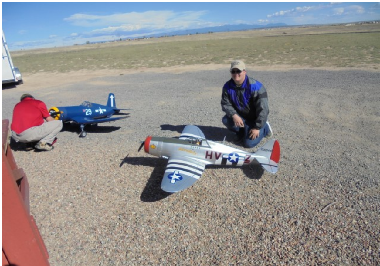
BRANDON'S HANGER 9 P-47