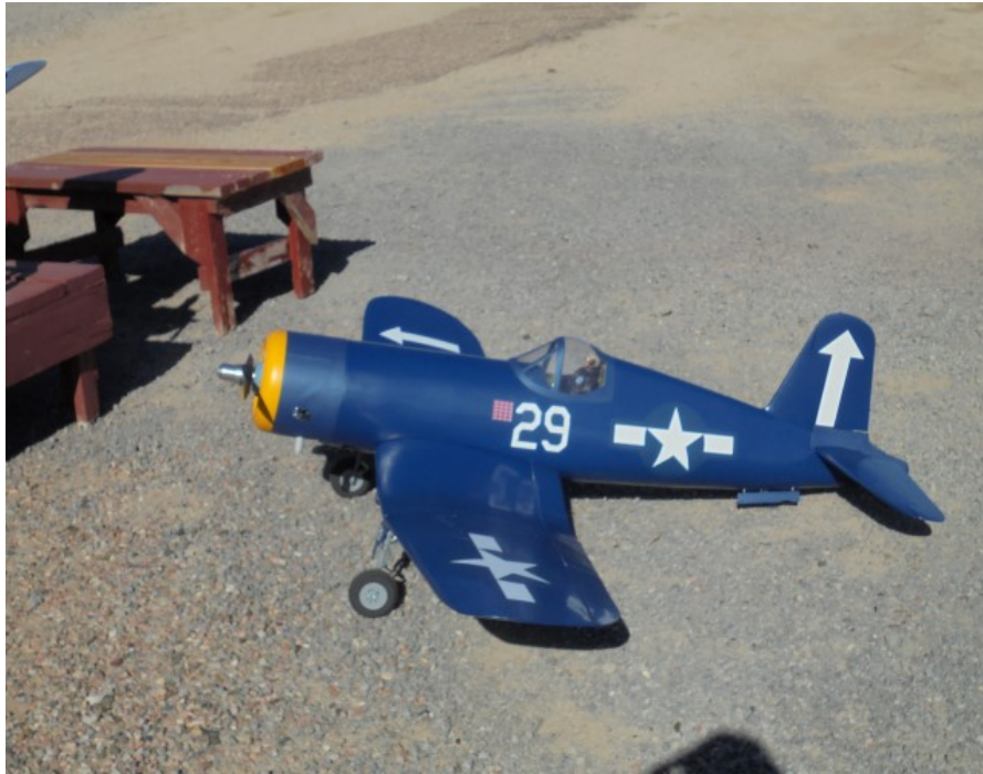
BRIAN'S TOP FLIGHT F4U