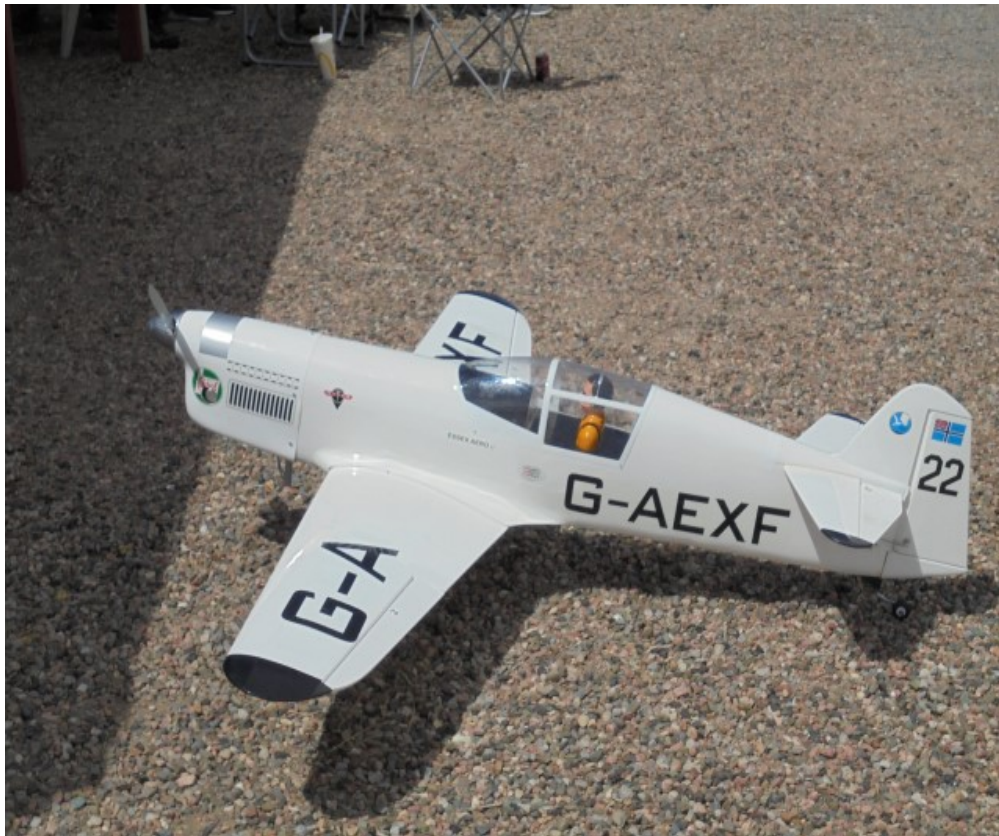
AARON'S PERCIVAL MEW GULL PREWAR RACER