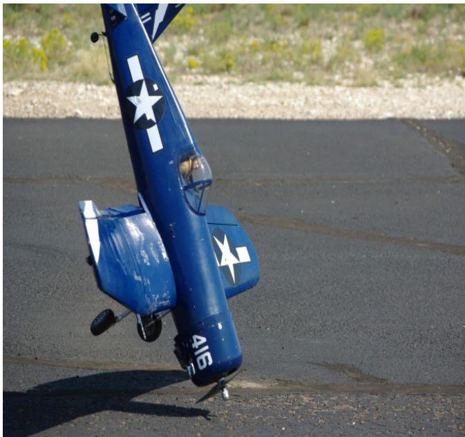
OOPS MOMENT FROM A WARBIRD EVENT