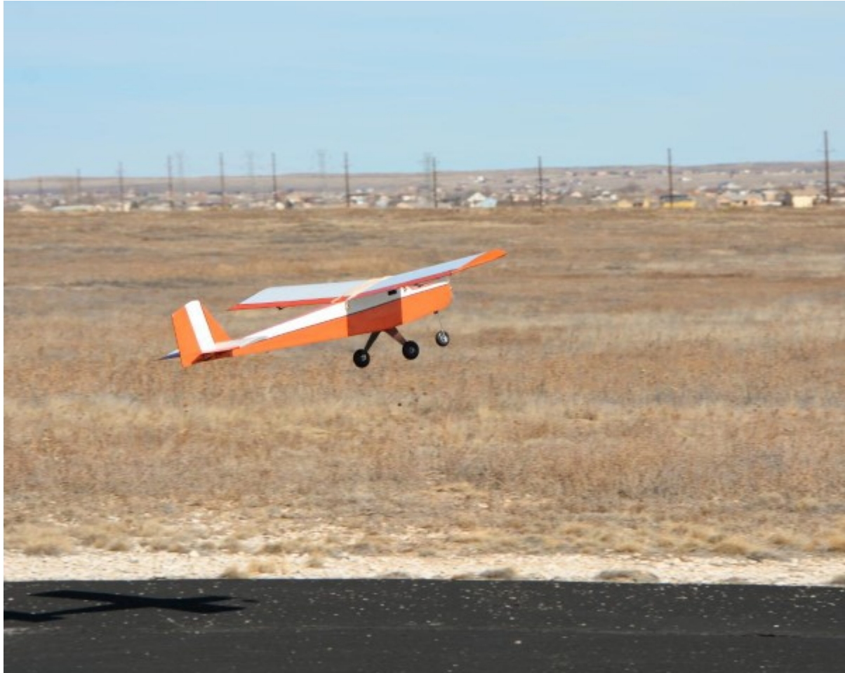
Chuck introducing a potential new member to the enjoyment of model airplane flying