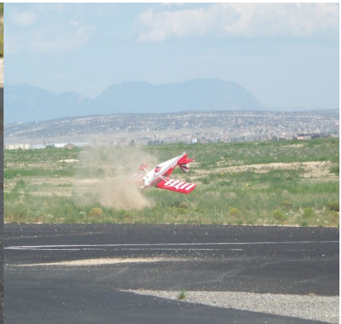
ONE POINT LANDING AT BIG BIRD EVENT