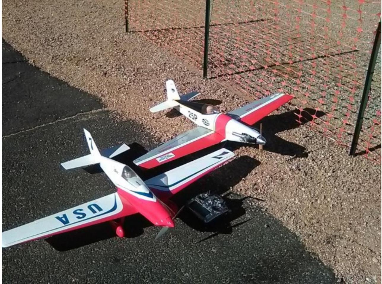
R to L Duane's EF1 and Larry's old Sig Mustang 450 F-1

SKY CORRAL WAS VERY ACTIVE IN PYLON RACING FROM THE EARLY 70's TILL THE MID 80's. MANY MEMBERS COMPETED IN QUARTER MIDGET, QUICKIE 500 AND FORMULA 1. THE CLUB HOSTED RACES WITH ENTRIES FROM ALL OVER COLORADO.