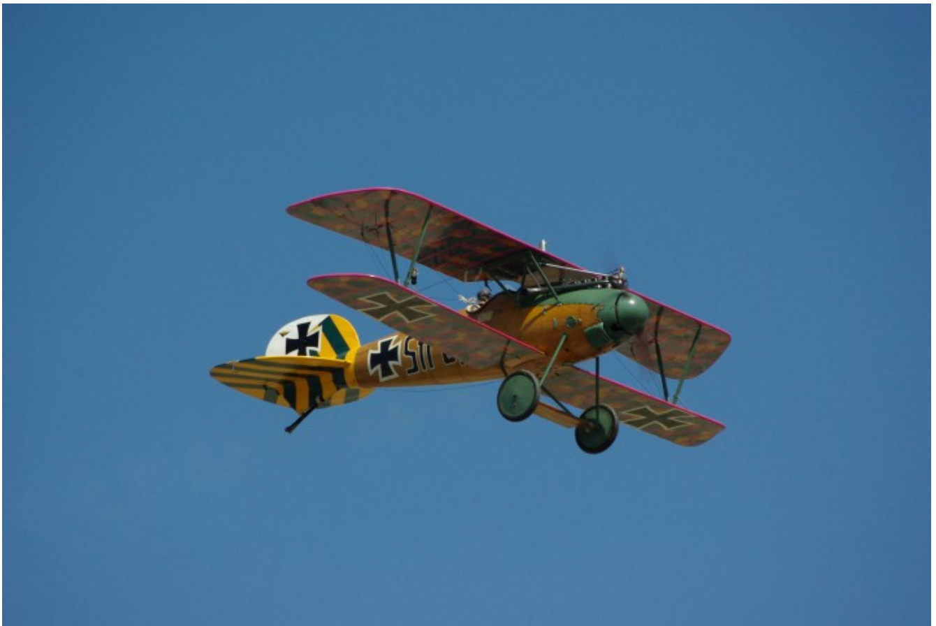
FANTASTIC ALBATROS D-II AT WARBIRDS IN 2009